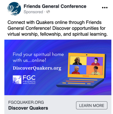
Sept 15, 2020 ad