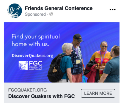
Feb 18, 2020 ad