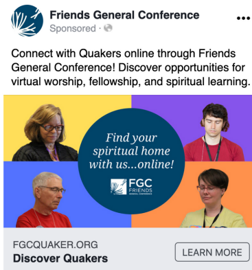
Sept 15, 2020 ad