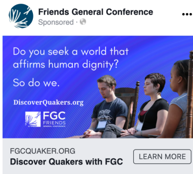
Feb 7, 2020 ad