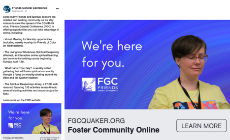
Apr 9, 2020 ad (Long text with image)