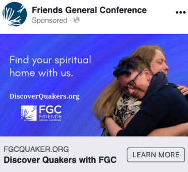
Feb 7, 2020 ad